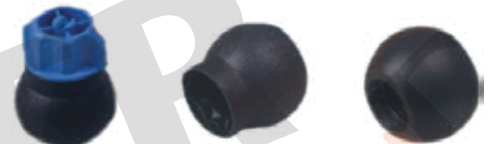
Threaded Ball Quick Ball