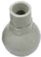
Full Cone spray ball Tip