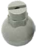
Flat spray Ball Tip